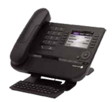
8068 IP Premium DeskPhone

Alcatel-Lucent has extended wideband audio across its Premium DeskPhones, supporting the industry-standard G.722 implementation currently being rolled out by public network service providers. The Premium Deskphones also pair with monaural and binaural headsets supporting wideband audio, noise cancellation and Bluetooth 1.2.