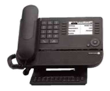
8038 IP / 8039 TDM Premium DeskPhone