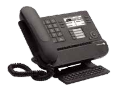
8028 IP / 8029 TDM Premium DeskPhone